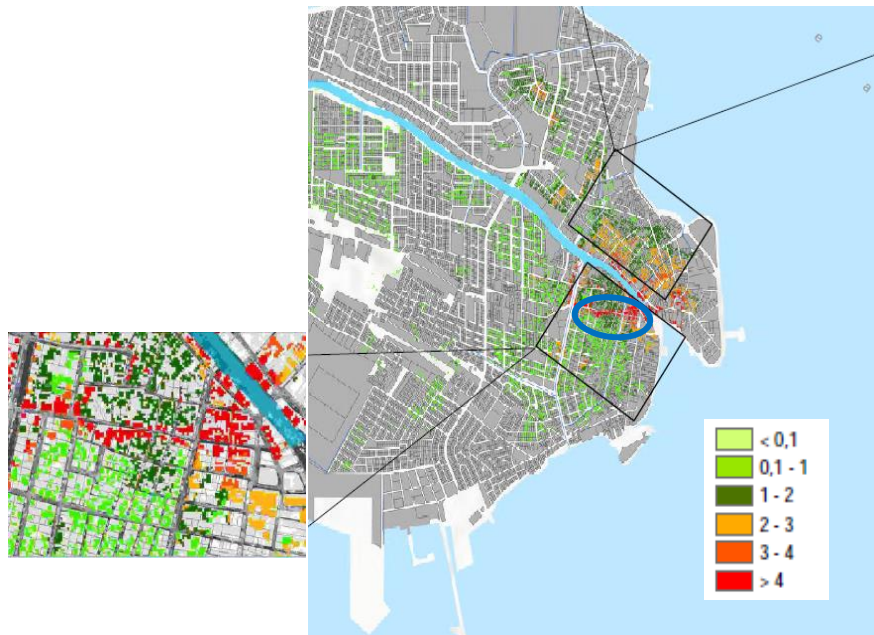
Figure I-2. Annual average loss (US$/m 2 ) projected by flood for Belize City*

* The blue circle indicates the location of Orange Street.