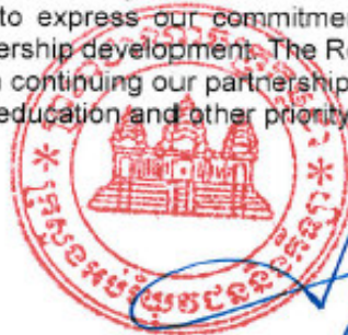
H.E. Dr. Hang Chuon Naron Minister Ministry of Education, Youth, and Sport