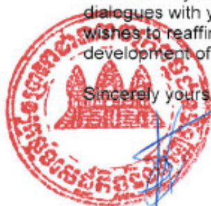
H.E. Dr. AUN Pornmoniroth Senior Minister Minister of Economy and Finance