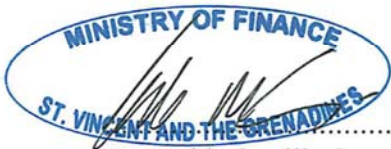
Honorable Camillo Gonsalves Minister of Finance Ministry of Finance, Economic Planning, Sustainable Development and Information Technology