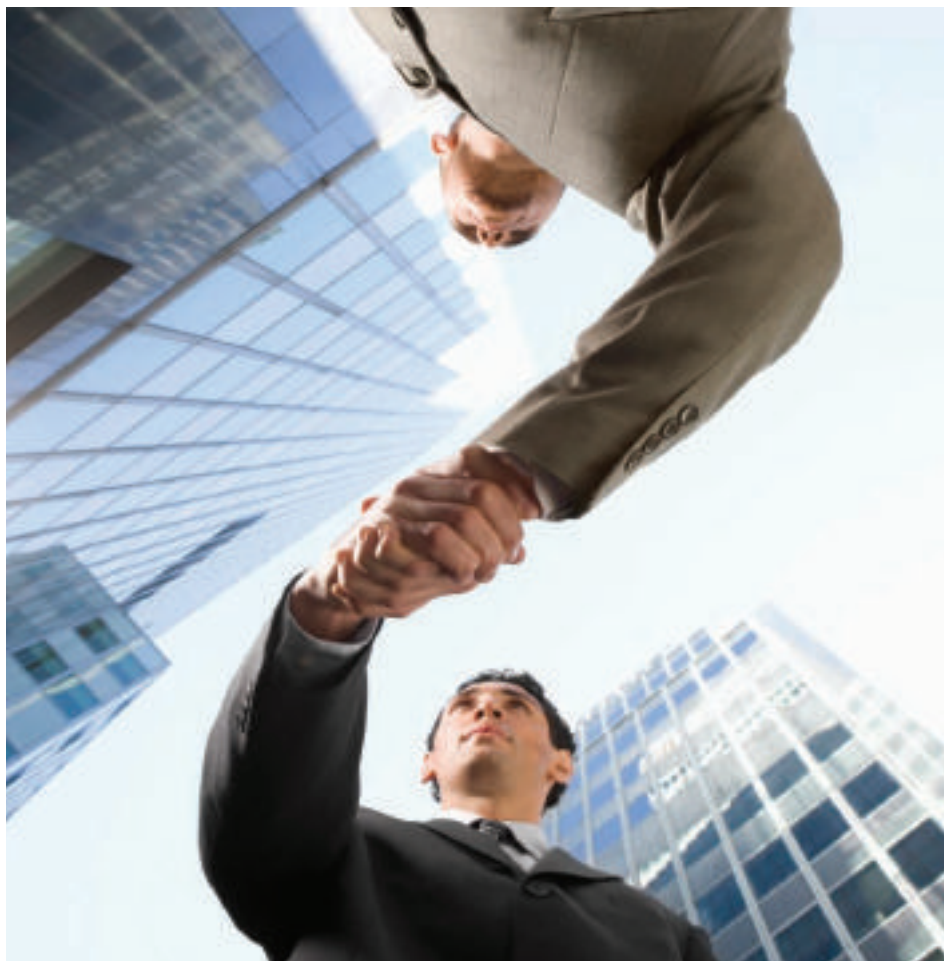
Some companies have sharpened their portfolios through M&A

The developments in shale gas in the US have been much more dynamic. This trig-