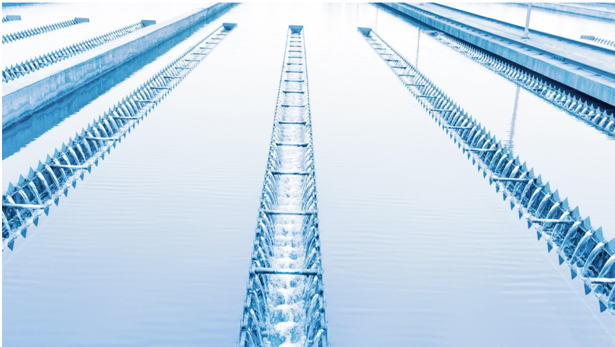
Modern urban wastewater treatment plant.