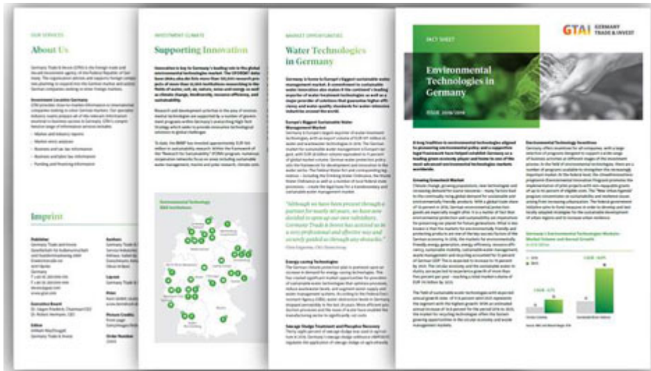
Fact Sheet - Environmental Technologies in Germany