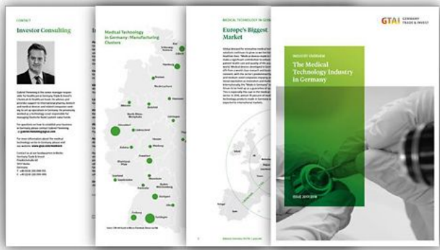
Industry Overview: The Medical Technology Industry in Germany