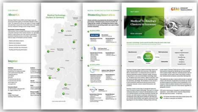
Fact Sheet: Medical Technology Clusters in Germany

Find our selection of free publications for your success here: