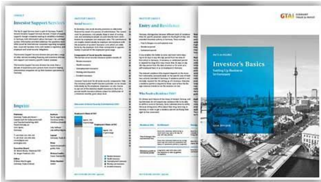
Fact Sheet: Investors Basics - Setting Up Business in Germany

Looking for more industry-specific information and opportunities for you? Check out our range.