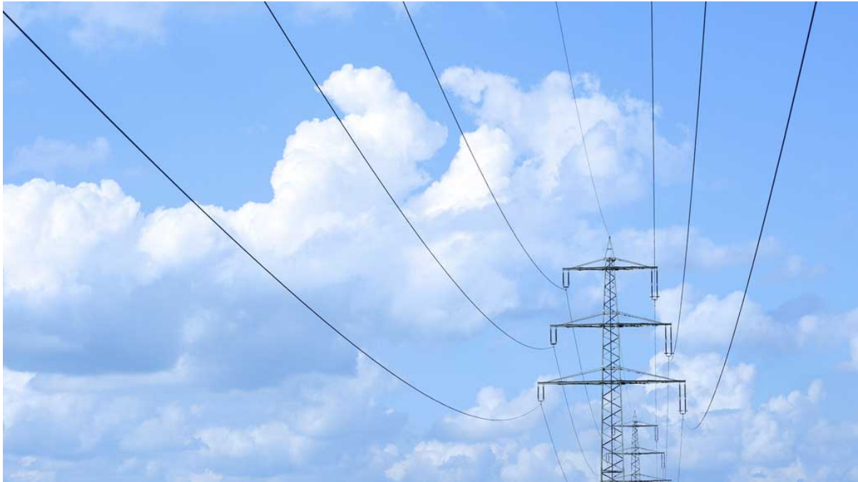
Stromtrasse vor blauem Himmel