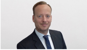
Henri Troillet | © GTAI