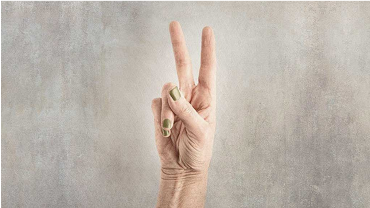
Silver Economy - Peace Sign | © gettyimages.com / Patricia Toth McComick