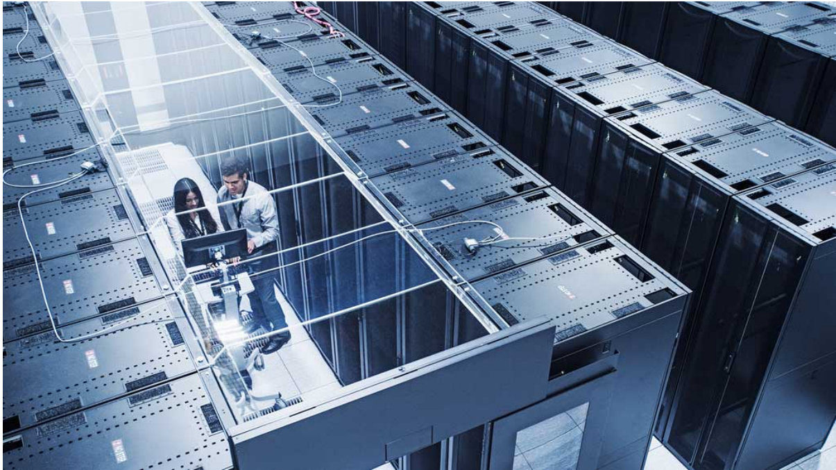
High angle view of technicians working in server room.