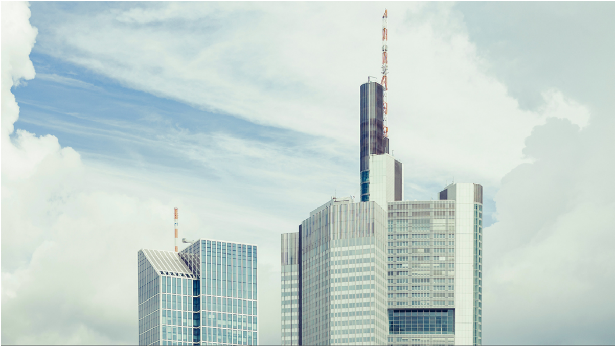
Modern office Buildings in Frankfurt, Germany