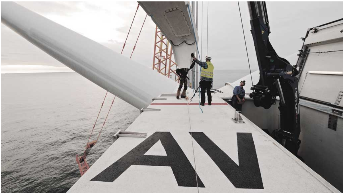
Mounting rotors on a REpower 5M in the Alpha Ventus Offshore Wind Park